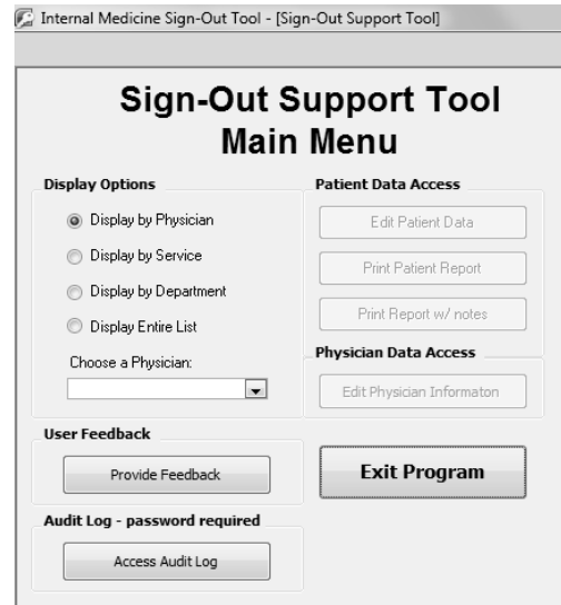
Figure 1. Main menu

A resident can navigate through the different patients on the current list. The resident can add a new patient on this screen. The resident can also provide feedback, return to the main menu, or read instructions about the tool. Finally, the resident can choose to navigate to the daily progress note screen (Figure 3).